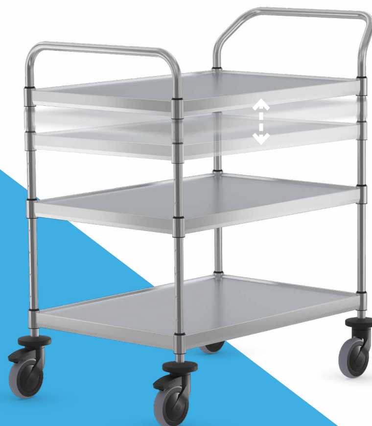
Durable shelf connection and strong welds for maximum load capacity

less transport volume required due to the flat pack design